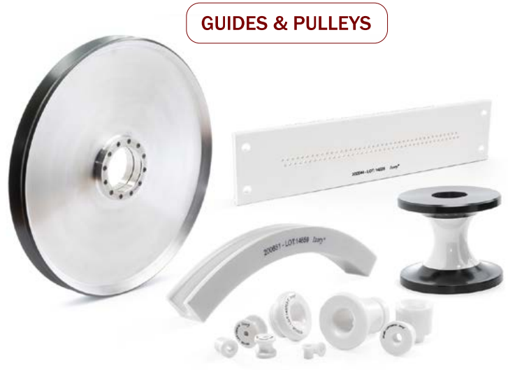
GUIDES & PULLEYS